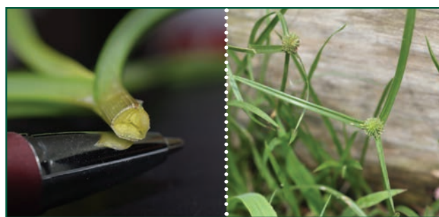
Figure 1. Cross-section of triangular stem (left) and three-ranked leaf arrangement (right) of sedge and kyllinga species.

The sedge family (Cyperaceae) is one of the largest families of monocots in Texas and contains hundreds of different species. However, the most common species found in turfgrasses include yellow nutsedge ( Cyperus esculentus L.), purple nutsedge ( Cyperus rotundus L.), annual